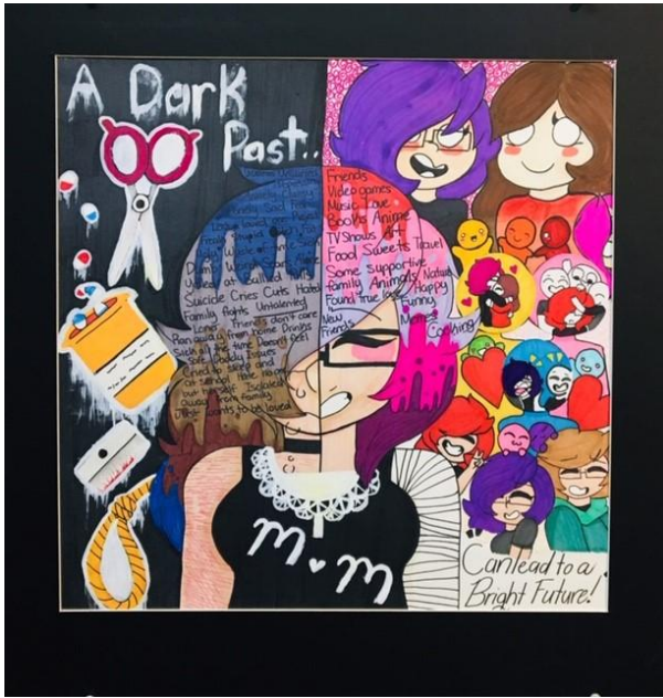
"Dark to Light" by Micheala Malonzo of Richmond High

A number of ceramic works were also on display in glass cases at the RAC, as well as many mixed media pieces employing an inventive array of materials that ranged from newspaper to makeshift $100 bills to candles and more.