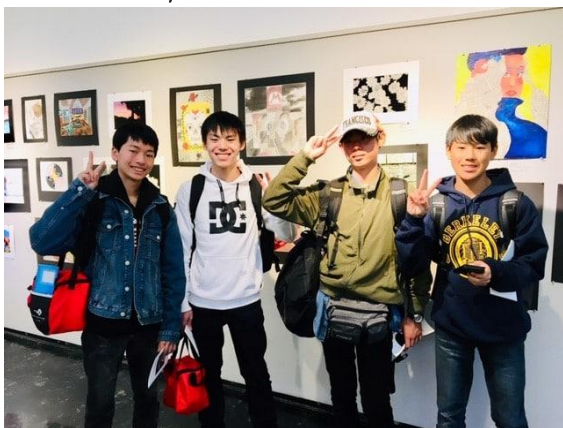
Students from Shimada, Japan, a sister-city with Richmond, attend the WCCUSD Art Show at the Richmond Art Center.

For its part, the WCCUSD Student Art Show will be celebrated with a reception at the RAC Tues., April 16, from 5-7 p.m. That particular show will be on display at the RAC through April 26. To learn more about the WCCUSD Student Art Show or the spring exhibitions, visit the Richmond Art Center's website here or call 510.620.6772.