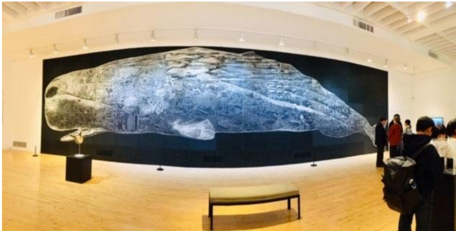
"Or the Whale" by Jos Sances.

If you go to see the student show, be sure to take time also check out Jos Sances' "Or, the Whale," a life size drawing of a sperm whale that's embedded with a history of capitalism in America. It's truly epic!