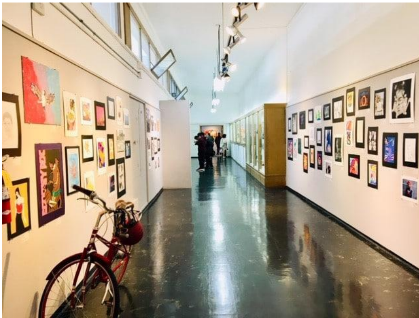
The WCCUSD Student Art Show

The teacher-curated exhibition is sponsored by the school district and opened up March 26. According to a statement by the Richmond Art Center, the show "represents the wealth of student artistic talent in the district, as well as best practices in delivering an art-based curriculum. The Richmond Art Center and WCCUSD share an ongoing vision that art education is a crucial component of a thriving and productive society."