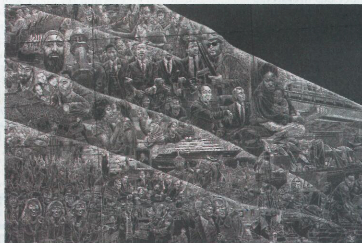
Detail includes civil rights leaders and Black Panthers.

For all the attraction of its scale and graphic power, it is