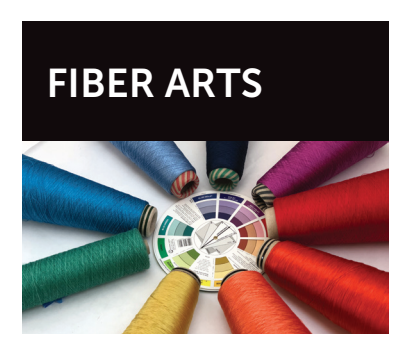
TABLE TOP LOOM WEAVING

drawing class in Fall 2019. Sat, Sep 14 – Nov 23 2:00 – 4:30 pm